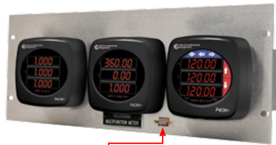
Front RS232 Port

The displays are connected to the meter through their back serial ports. The serial port connection from the displays is connected to Port 3 of the Nexus® 1252 meter. There is a serial port connection from Port 1 of the Nexus® 1252 meter to the front of the mounting unit.