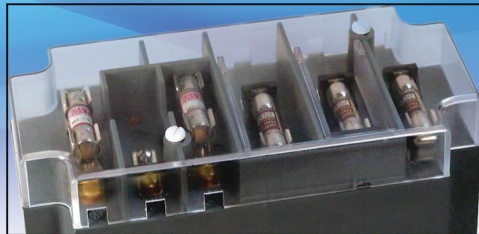
Clear Plastic Cover