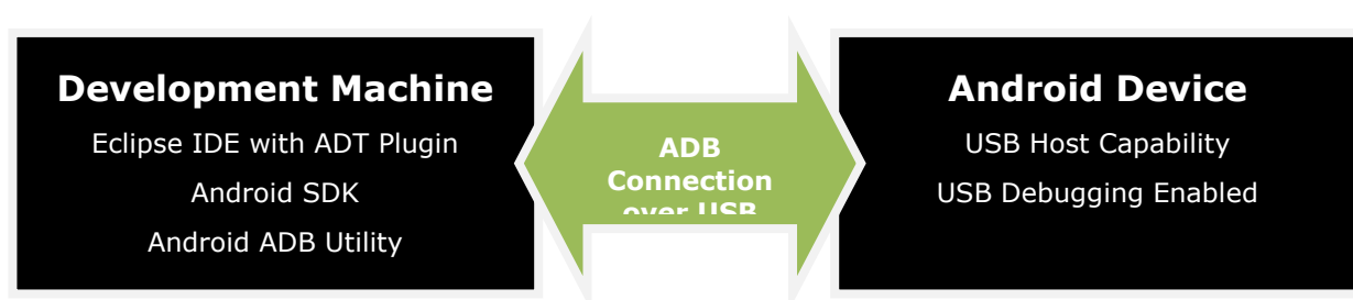
Figure 1: Development Configuration

A summary of the required configuration is provided in the diagram below.