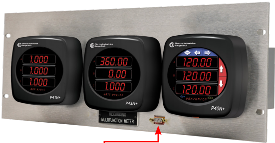
Front RS232 Port

The displays are connected to the meter through their back serial ports. The serial port connection from the displays is connected to Port 3 of the Nexus® 1252 meter. There is a serial port connection from Port 1 of the Nexus® 1252 meter to the front of the mounting unit.